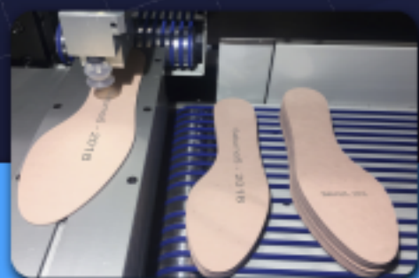
MANUAL PLACEMENT DIRECTLY ON THE MACHINE