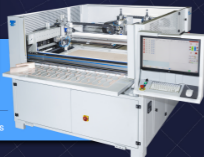
CUTTING IN MULTI-SHEET MODE AND MANUAL UNLOADING OF THE CUT PIECES

The cutting heads allow the processing of any type of material up to 10 millimeters thick, including fibers, coupled, elastomers, thermoplastic, leather and regenerated leather. Saturno 5 , is therefore designed to guarantee high productivity, a perfectly uniform and high quality processing on both sides of the cut pieces (thanks to the rigid cutting plane) and a high saving of material, labor force and energy consumption. Model design and selection of working programs can be performed by simple operations using our "leacad" software.